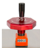
調整手輪 & 位置顯示器 Adjusting device & Position indicator