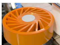
分瓶輪 Bottle separation wheel