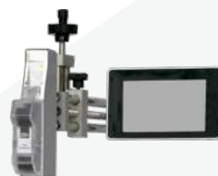
卡匣式噴印字機 & 可調支撐座 (選配項目) Inkjet printer & Adjustable support rack (optional item)