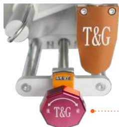
便利調整手輪 & 位置顯示器 Convenient position adjusting device & Position indicator