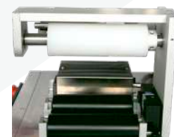
自動感應啟動電眼 & 快速調整扶瓶滾輪座 Labeling start-up sensor & Quick-changeover bottle holder