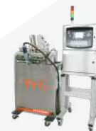
分張機搭配噴印機 (選配) & 工作台車 (選配) Compatible with Inkjet Printer & Working table