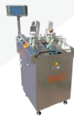
AI-470 真空吸取式分張機 Friction Feeder (Vacuum type) (model:AI-470)