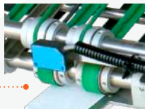
德國 SICK 測物電眼 SICK (German-brand) photoelectric sensor for feeding