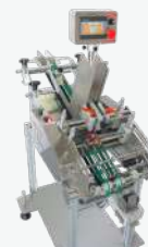
AI-450S 人機集料型分張機 & 工作台車 (選配) Friction Feeder (model:AI-450S) With PLC system & Working table